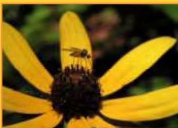
Randy Tindall Photos